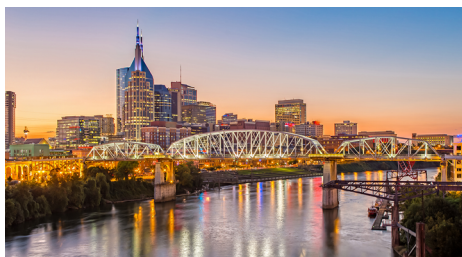
NASHVILLE, TN The Joseph | November 10–11, 2026