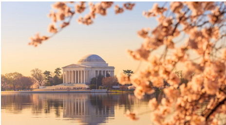
WASHINGTON, D.C. The Conrad | May 5–6, 2026