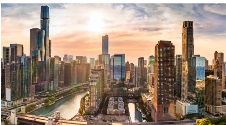
CHICAGO, IL The Ritz-Carlton | October 14–15, 2026